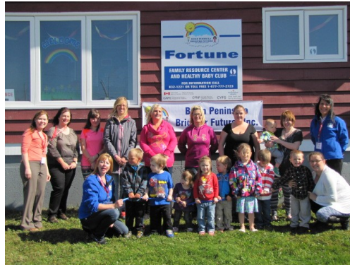
Fortune Family Resource Center Grand Opening September 28, 2015

federation Street for their Family Resource Center, thanks to a partnership with NL Housing. Residents rallied last October to garner support to find space for the Family Resource